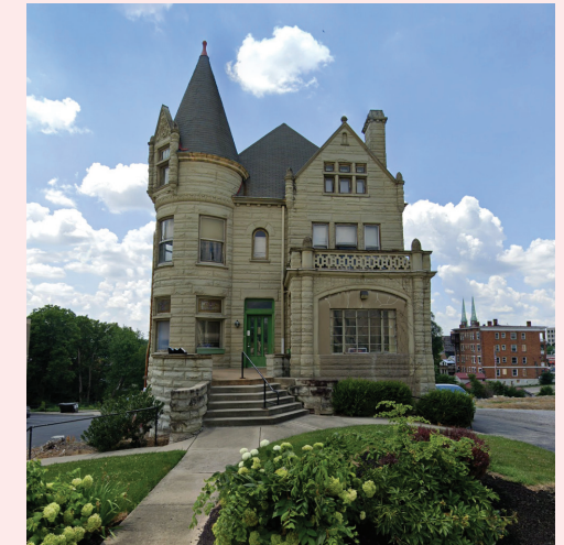
2421 Auburn Avenue, Cincinnati

The new center is centrally located in Mount Auburn, near the University of Cincinnati and low-income women who need us most. This property is a fixer-upper, but has the size, visibility and potential to become a mega center with six counseling rooms and three ultrasound rooms. We are modeling this new center after our existing center in Indianapolis, which saved nearly 20,000 babies in its first ten years.