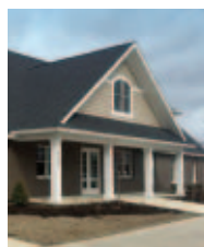
4600 W. Jefferson Blvd.