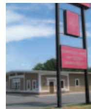
921 W. Coliseum Blvd.