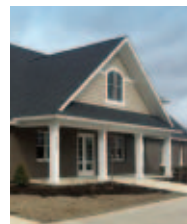
4600 W. Jefferson Blvd.