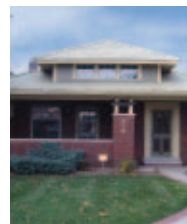
419 E. Wayne Street