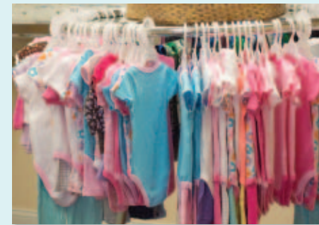
Crib Club baby "store"