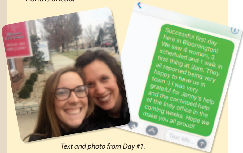
Text and photo from Day #1.

On February 1, a new Women's Care Center opened next door to the large Planned Parenthood abortion clinic in Bloomington. On day #1, the counselors (shown) served four women. And this is just the beginning! Hundreds of moms and babies will be saved in the months ahead.