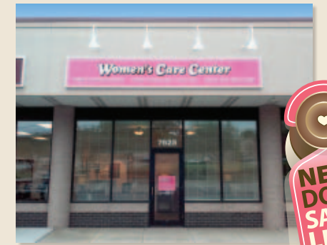
New Baltimore center

The abortion clinic across the street from our new Baltimore center is "Whole Woman's Health." This is the same abortion clinic as in Peoria, Illinois. In 2013, a Women's Care Center was opened in Peoria right next door to Whole Woman's Health in that community. Since we opened in Peoria, abortions in that community have declined 37%.