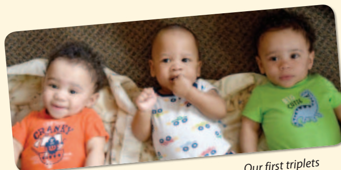
Our first triplets