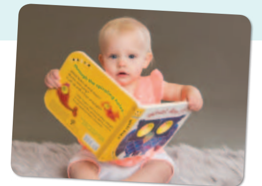
Baby Chloe loves to "read"... thanks to you!

And thanks to your generous support , every small child who visits our center leaves with books to encourage a love of reading!