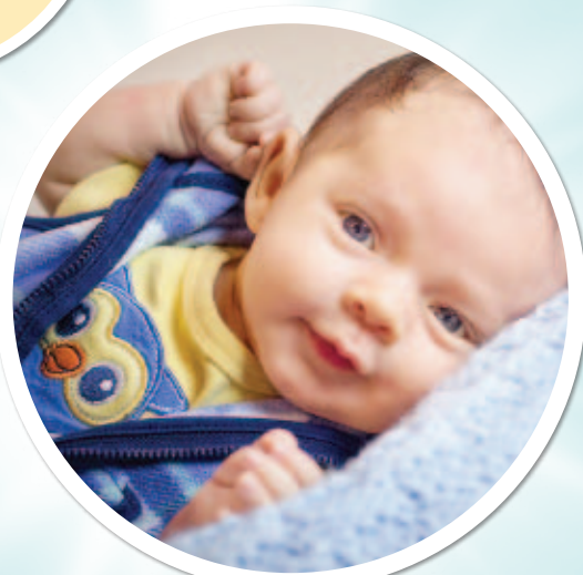
Cicily's baby Grey

Opening in Merrillville! (details inside)