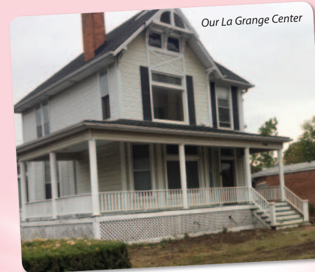
Our La Grange Center