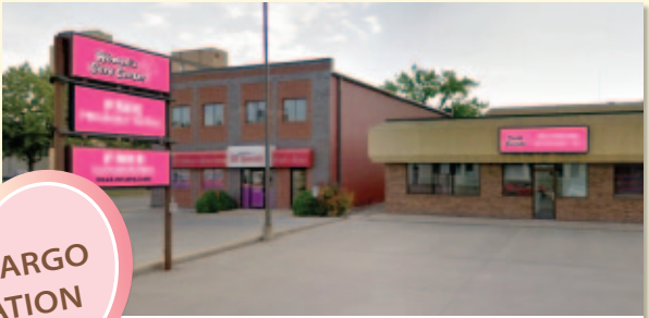
NEW FARGO LOCATION

121 N. University Drive, Fargo, ND 58102