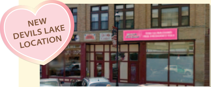
NEW DEVILS LAKE LOCATION

In Fargo, a new location has been found downtown near the abortion clinic. Counselor training is underway. Because of your support, the improved counseling model is already seeing benefits, but more is coming with the new location and Internet program.