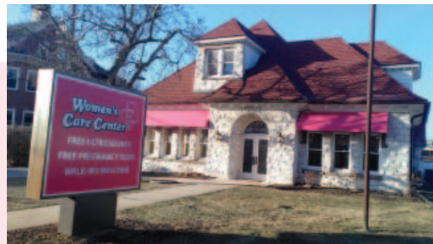
New center at 40 S. Richland Avenue

Here is a glimpse of our life-saving new center on S. Richland Avenue...only possible because of the love and support of partners LIKE YOU!