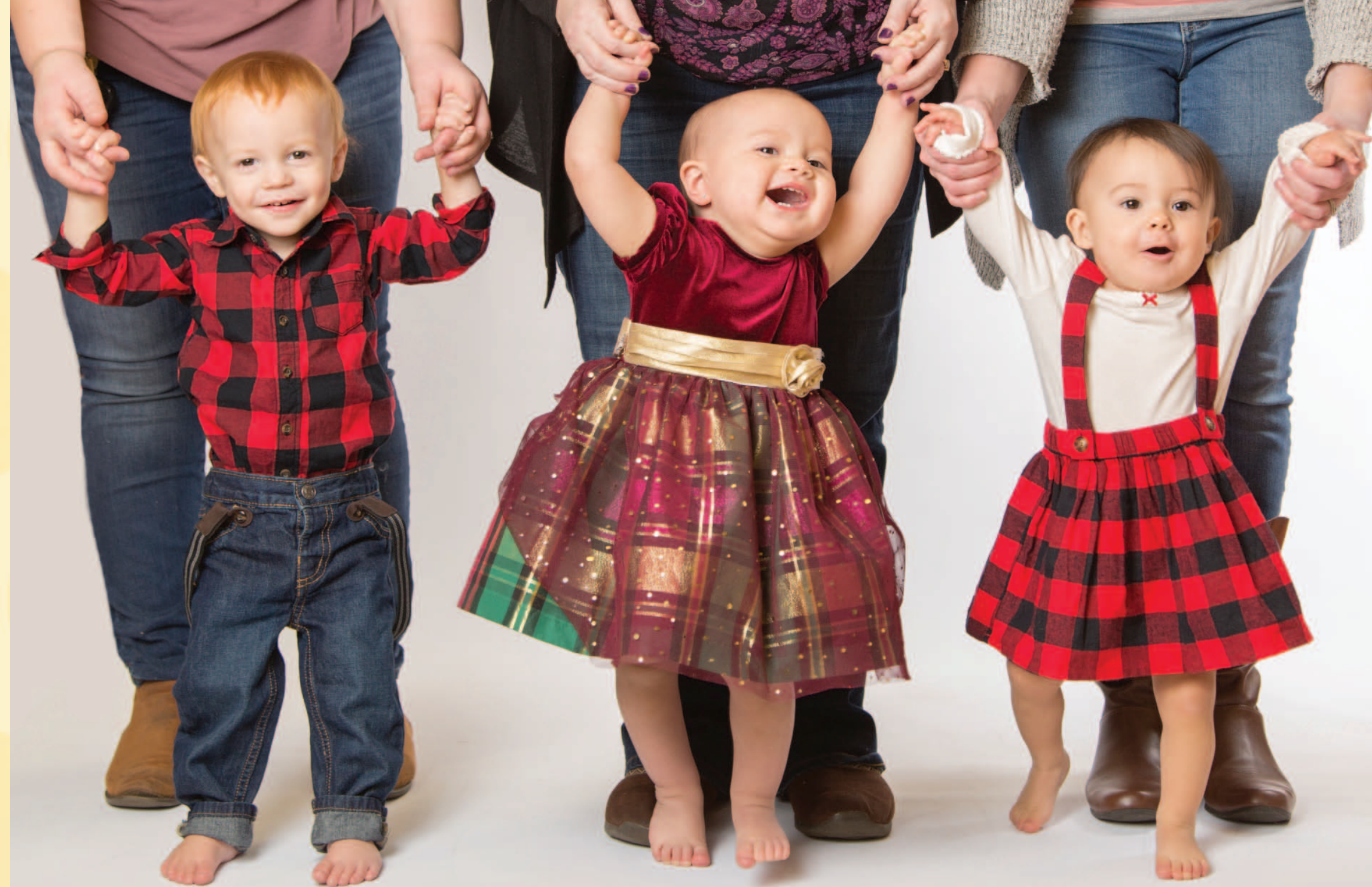
Mommy and Me Music class at Women's Care Center in Elkhart

The Elkhart mom in the middle shared a message for you: