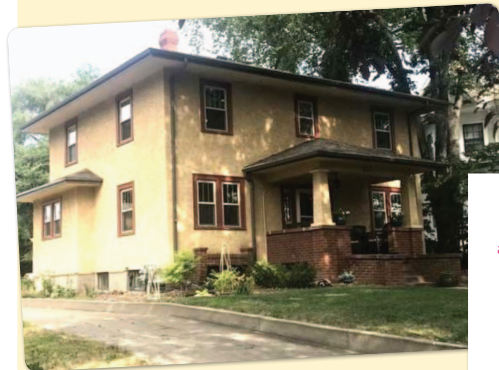
614 N. 4th Street