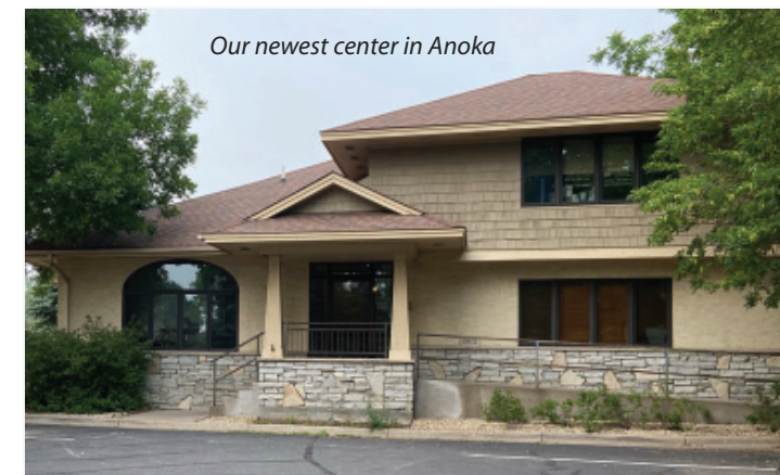
Our newest center in Anoka

Seeing the success we are having in Duluth, we are being joined by a new center in Anoka (just outside of Minneapolis). Together we will save so many babies in Minnesota.