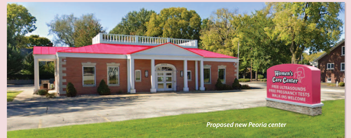
Proposed new Peoria center